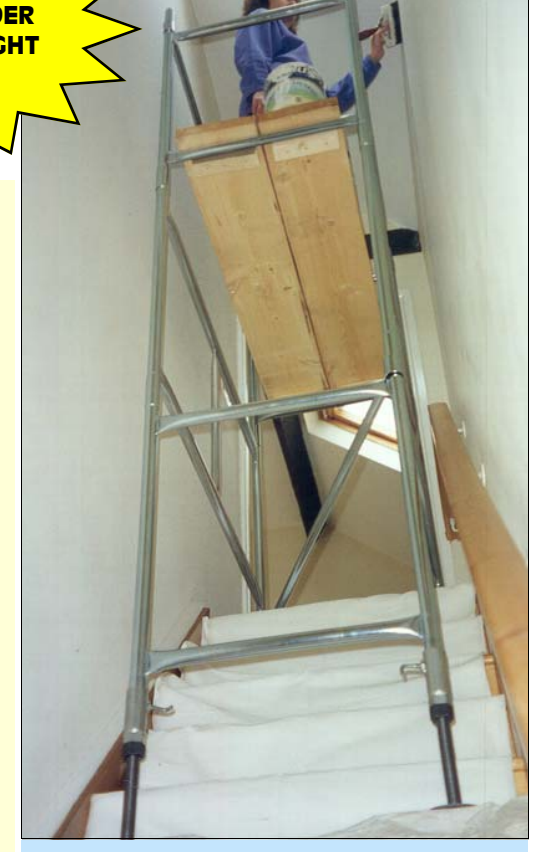
Domestic Towers can be converted into scaffolds to provide safe access in most stairwells. Much safer than flimsy steps and scaffold boards!