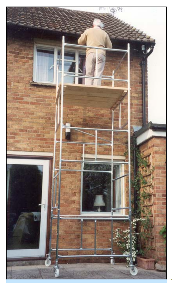
Domestic Tower 4' x 4' base size. Safe & easy. Shown above is a 10ft platform height tower which gives comfortable reach to a standard 16ft gutter.

Domestic Towers are designed for occasional DIY use and combine high quality with a very affordable price. Although very low-cost, they are not at "rock-bottom" prices because Domestic Towers are manufactured by skilled engineers from prime quality steel - not "knocked-up" in some back shed or farmyard from scrap steel. It may sound daft but many really are !!